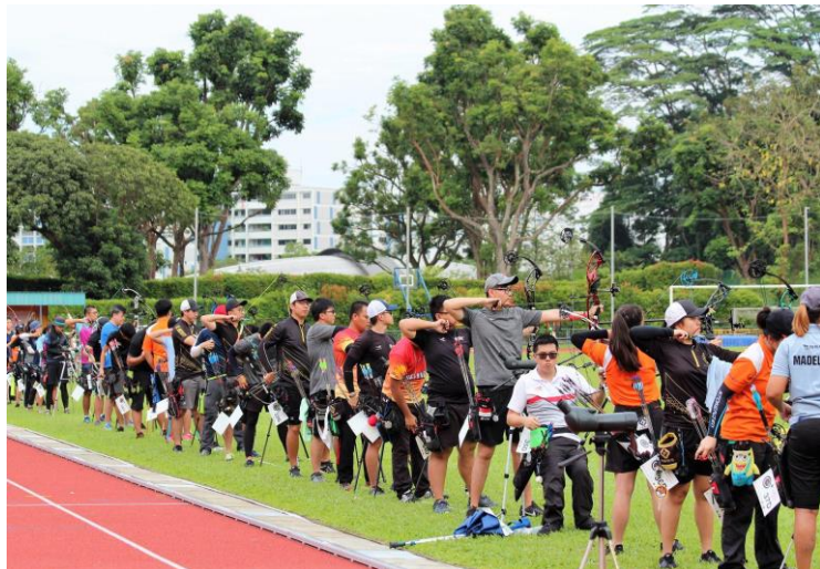
Singapore Archery Open 2018