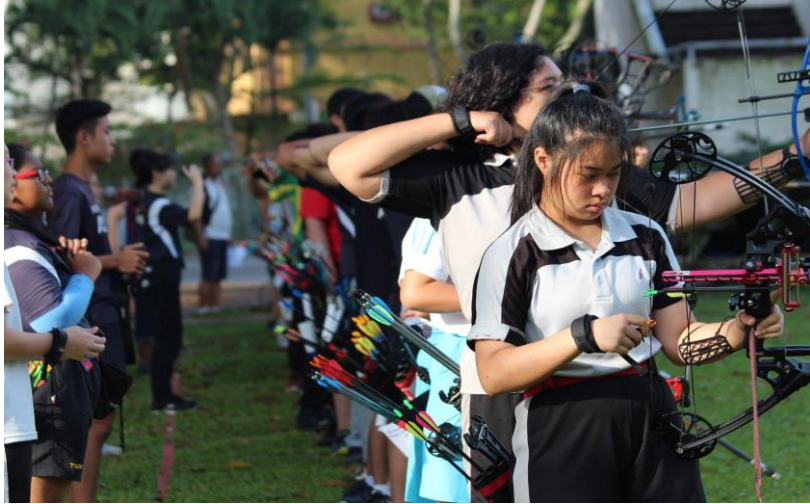
National Inter-School Archery Championship 2018 B division