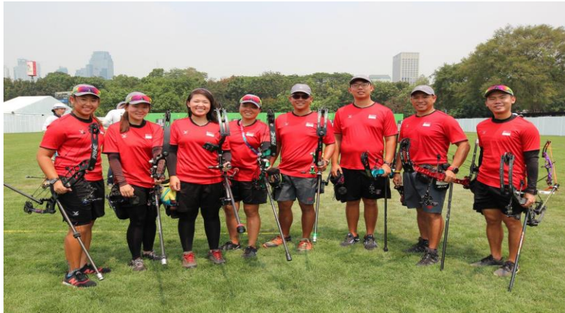
ASEAN Games archer representation