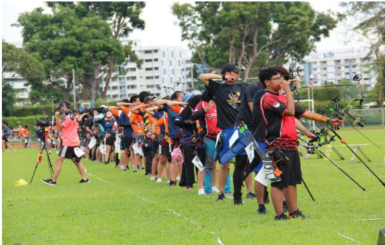
Singapore Youth Archery Championship 2018