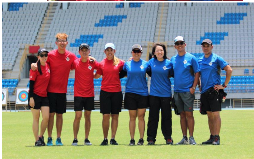
Archer representation at Asia Cup Stage 3 Taipei City